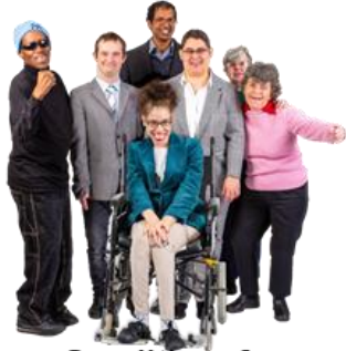
Coalition for Change

A group called the Coalition for Change has been set up